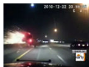
Dashboard Cam Video of Speeding SUV