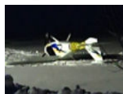
Plane Makes Emergency Landing in Backyard