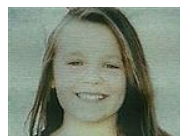
Teen Missing, Never Shows Up at Friend's House

Comments (0) Login or register to post a comment: