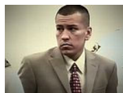
Accused Rapist Cross-Examines Alleged Victim