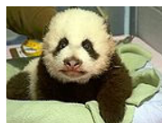
'GMA's' Up-Close Look at Atlanta's Baby Panda