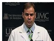
Doctors: Giffords Making "Significant Strides"